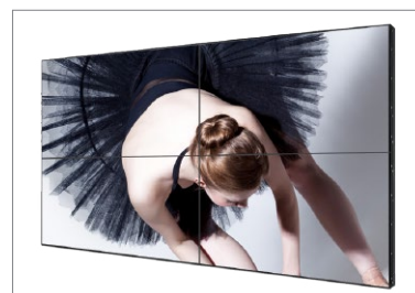
Tiling function and DVI, VGA and DisplayPort looping simplify the video wall setup.