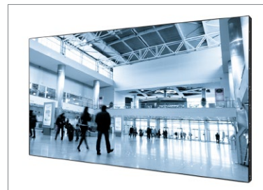
500 nits high brightness panel assures image clarity even under high ambient light.