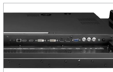
Versatile connectivity: VGA, DVI, HDMI, DisplayPort, CVBS, Component.